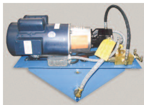
▶ Power Unit w/Controller