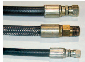
▶ Double Wire Braid Hose